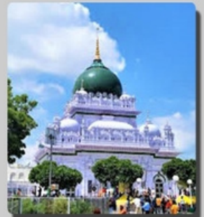
Dewa Shareef Dargah