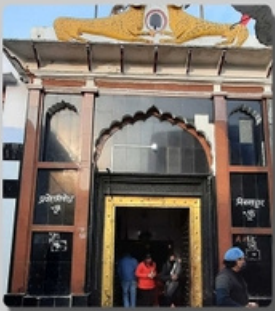
LODHESHWAR MAHADEV MANDIR